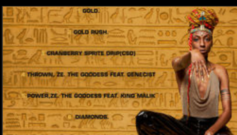
Spotlight: Ze: The Goddess