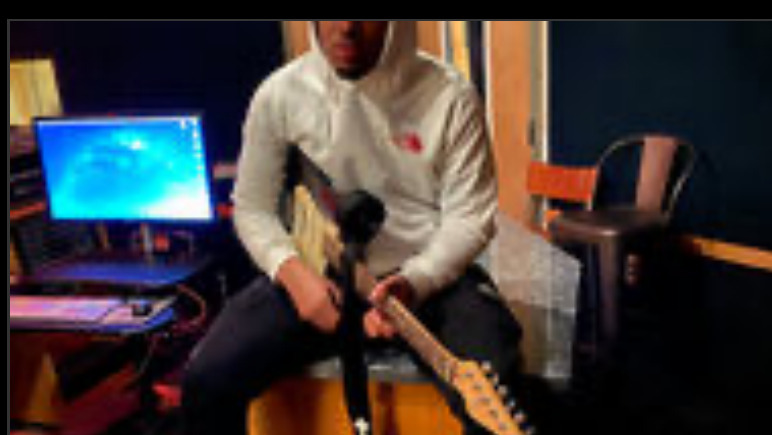
Chop, Chop, Get to Listening to "Cut The Ties"